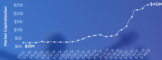
NFTs/Collectibles Tokens Market Capitalization NFTs Market Cap Grow 1,785% In 2021

40% US millennials say they're likely to buy NFTs.